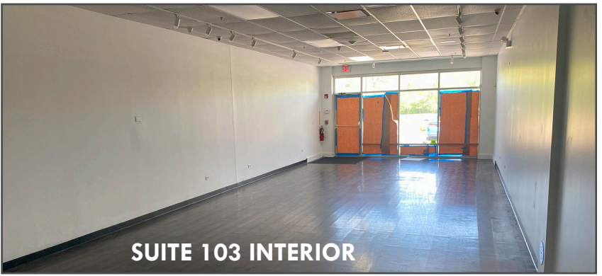
SUITE 103 INTERIOR