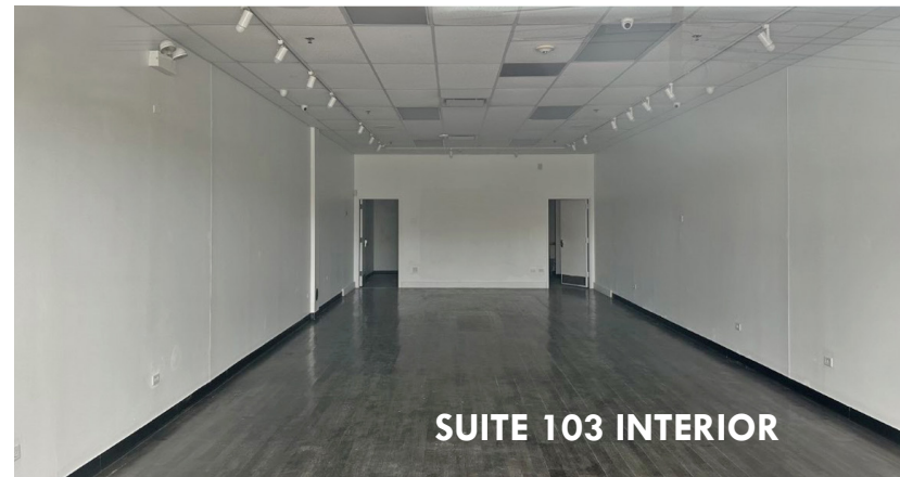
SUITE 103 INTERIOR